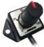
Optional Remote Knob PM-2999

LENGTH: 4 7/8" WIDTH: 3 7/8" HEIGHT: 2 7/16"