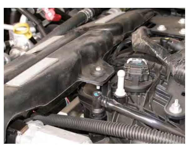
10. Reinstall intake tube over grommet being careful that it properly seats.