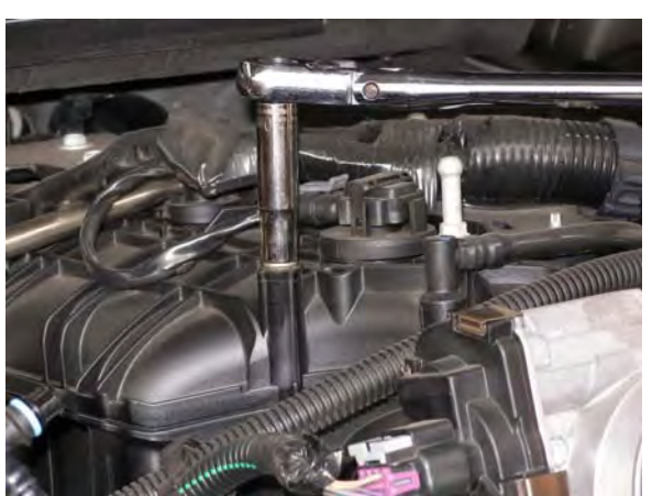
8. Remove ball stud that secured intake tube to manifold. Install allen bolt in countersunk hole in extension plate, then install on manifold and point towards front of motor. Install factory ball stud in hole on other end of extension plate. Tighten countersunk bolt and ball stud.