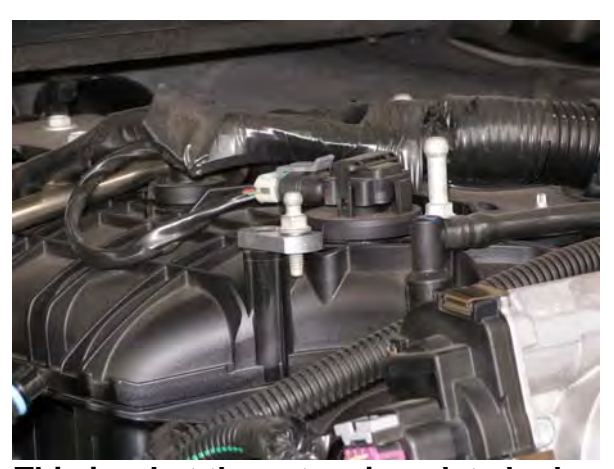
9. This is what the extension plate looks like installed. Remove the grommet that installs over ball stud from intake and install it on ball stud with the small diameter size facing up. This will make installing the intake tube much easier.