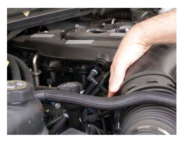
4. Disconnect breather tube from intake by gently pulling outwards. Loosen clamp at mass air sensor then remove intake tube.

2. Loosen the clamp securing air intake tube to the throttle body.