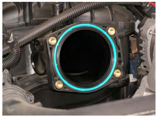
6. Use a 4mm socket to remove the top 2 studs from the intake manifold. The manifold should now look like the photo.