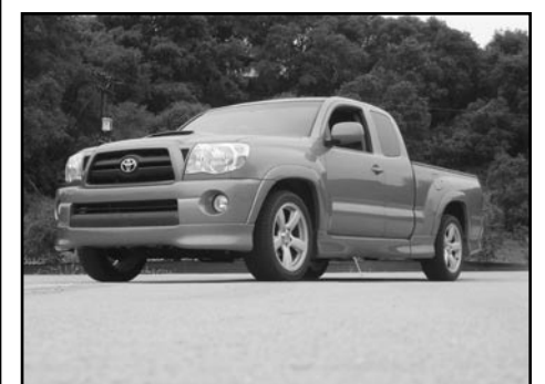
JBA Equipped - 2005 Tacoma X-runner 4.0L V6 5spd