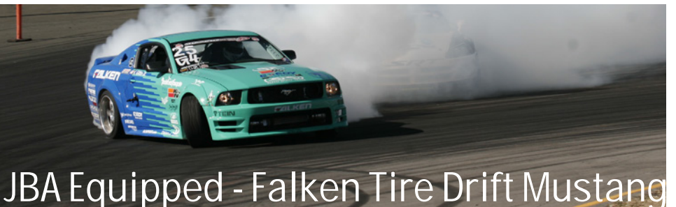
JBA Equipped - Falken Tire Drift Mustang

Sutton High Performance - 2005 Mustang 4.6L - Vortech supercharger Horsepower - 665rwhp • 1/4 Mile - 9.82 @ 136 mph