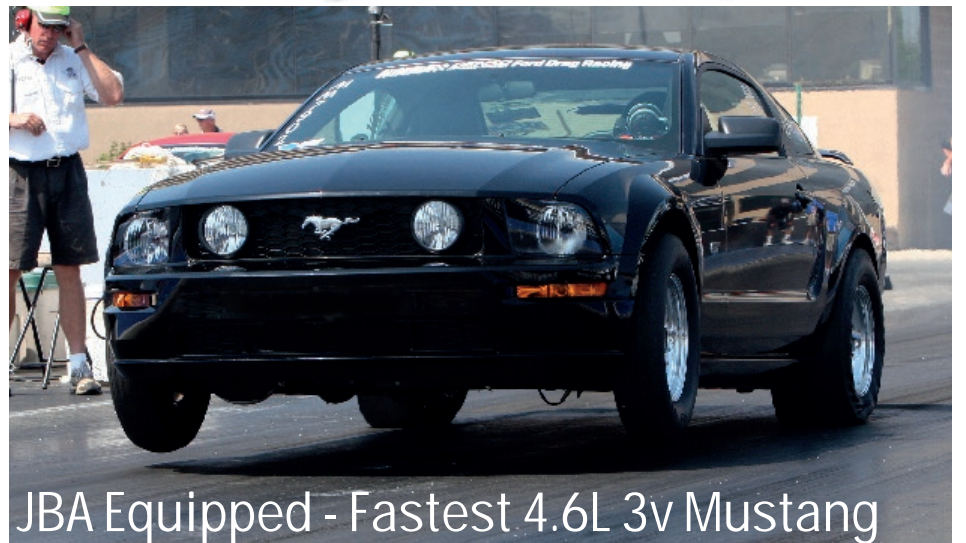
JBA Equipped - Fastest 4.6L 3v Mustang

Sutton High Performance - 2005 Mustang 4.6L - Vortech supercharger Horsepower - 665rwhp • 1/4 Mile - 9.82 @ 136 mph