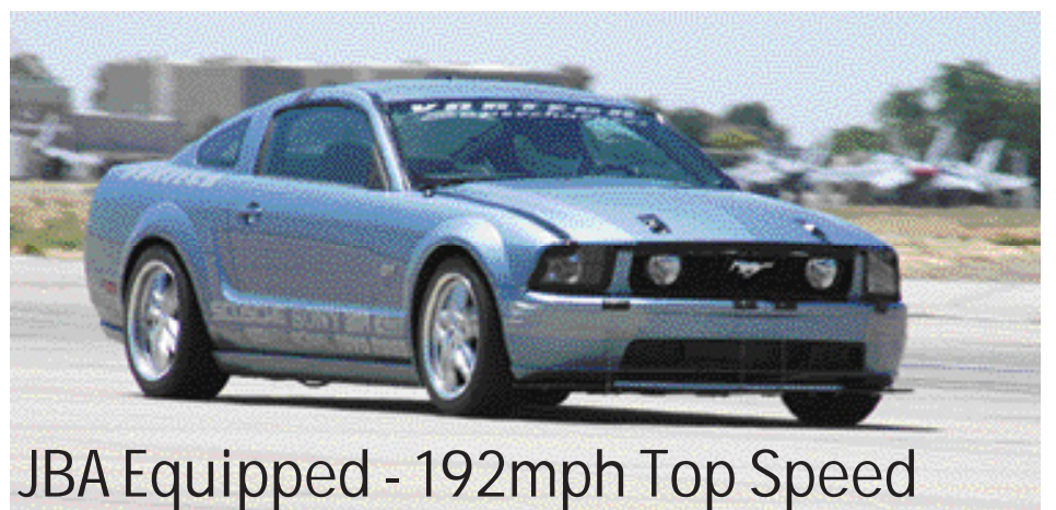
JBA Equipped - 192mph Top Speed

Vortech Superchargers - 2005 Mustang 4.6L 3v Horsepower - 575 • Top speed - 192 mph