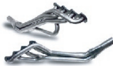
JBA Long Tube Headers Part No. 6675S

13. Reconnect the battery and start the vehicle to check for leaks.