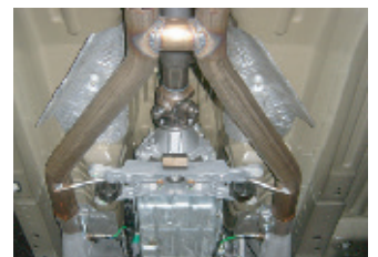
JBA Off-road H-pipe Part No. 6675SH