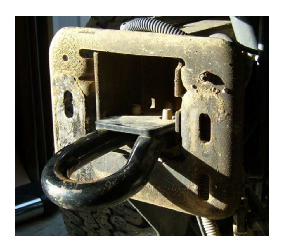
D. YOUR VEHICLE IS NOW READY FOR NEW BUMPER INSTALL.