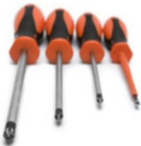
- PHILLIPS SCREWDRIVER OR SOCKET WRENCH SET