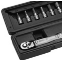
- TORQUE WRENCHES