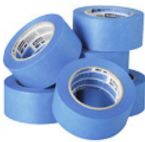
- PAINTERS TAPE TO AVOID SCRATCHES