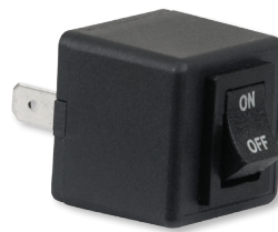
Medium Spade Relay Domestic and Japanese 1970-2009