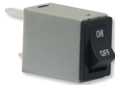
Small Spade Relay 2000 and Newer Domestic, Korean, and Japanese

Small Spade, Medium Spade and Large Spade Relays