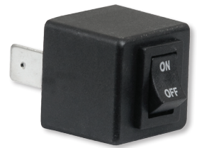
Large Spade Relay Volkswagen 1999-2005 Audi 2004-2006