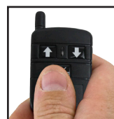
3-Button Remote Control

(1) 12-Button Remote Control, (1) 3-Button Remote Control, 10 Amp Battery Charger, 3-Way Trailer Adapter and Rain Cover