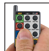
12-Button Remote Control