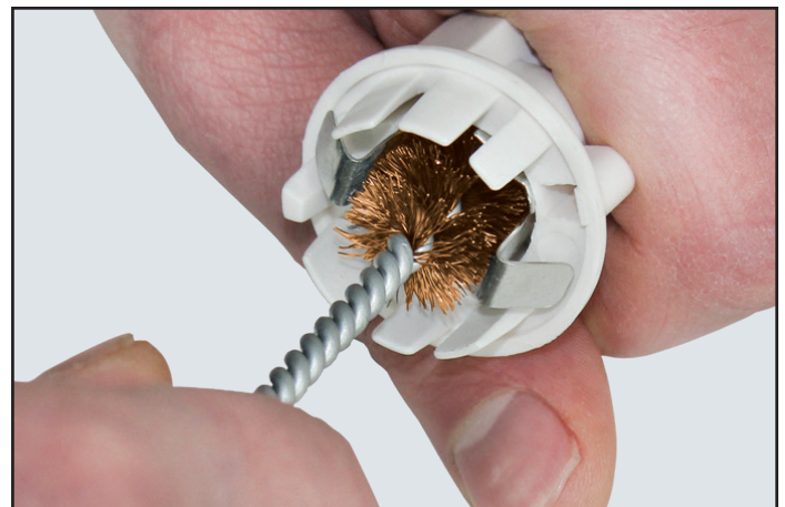
Thoroughly Cleans Bottom and Sides of Socket with One Motion