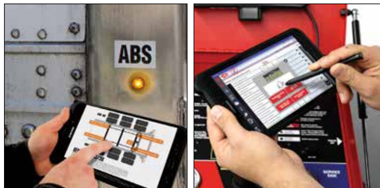
Military-Grade Tablet with Quick-Connect Docking Station #5705A Model Available with Standard Tablet