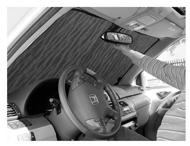
STEP 3: Lift the CUSTOM GOLD AUTO SHADE<sup>™</sup> against glass. Adjust the CUSTOM GOLD AUTO SHADE<sup>™</sup> in windshield, may overlap slightly with side windshield frame (A-pillars) and headliner.