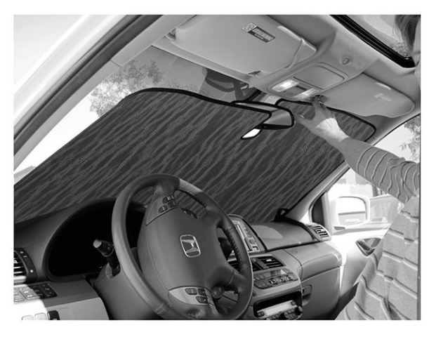
STEP 2: Tuck the CUSTOM GOLD AUTO SHADE<sup>™</sup> behind rear view mirror, if mounted on windshield.