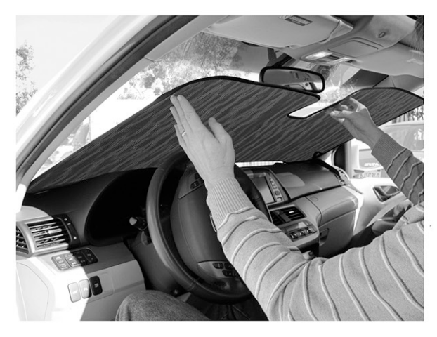
STEP 1: Unroll the CUSTOM GOLD AUTO SHADE<sup>TM</sup> across dash, gold reflective material facing out. Make sure the CUSTOM GOLD AUTO SHADE<sup>TM</sup> is centered in the windshield and placed down, where the glass meets dash.