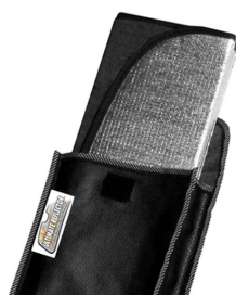
(Optional storage bag shown)

Simply reverse the installation steps, fold the unit and store in the trunk or under a seat.