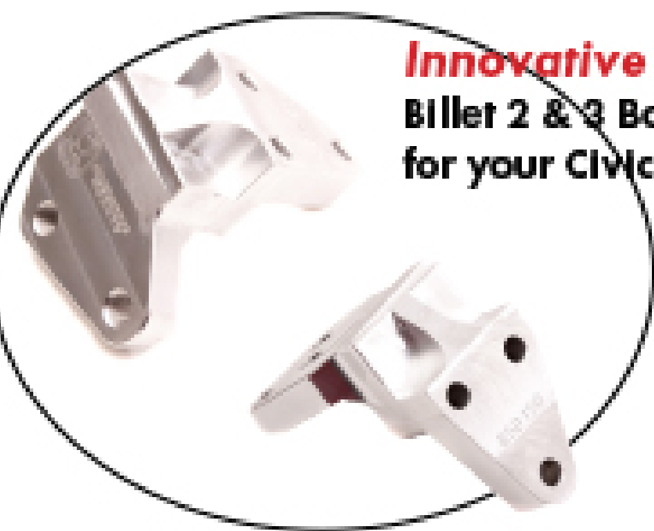
92-95 Civic 2 Bolt Post Driver Side Mount - 19510 / B19510

Innovative Mounts also offers Billet 2 & 3 Bolt Post Mounts for your Civic and Integra