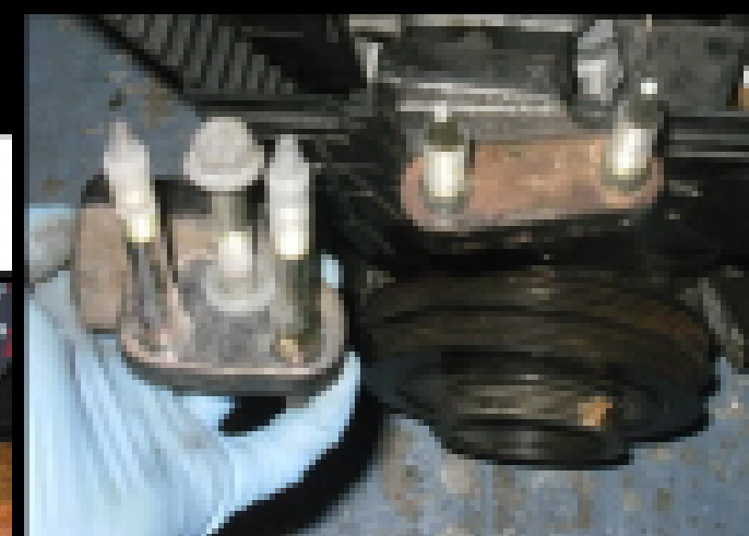
94-95 Civic & 94-01 Integra 3 Bolt Post Driver Side Mount - 10110 / B10110

Innovative Mounts also offers Billet 2 & 3 Bolt Post Mounts for your Civic and Integra