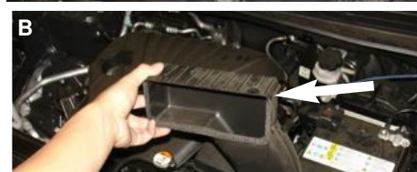
Figure A: Use a phillips screw driver and remove the two plastic retaining screws on the front vent duct. Figure B: This air duct will be removed.