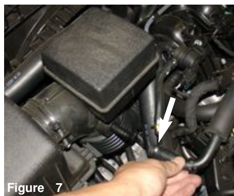
Figure 7 Disconnect the crank case vent tube from the air box air duct hose.