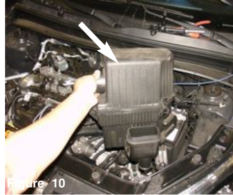
Figure 10 Lift up on the air box assembly and remove the entire air box assembly from the engine bay.