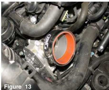
Figure 13 Place the 2.75" straight hose and two #40 clamps onto the throttle body and only secure the clamp on the throttle body side only for now.