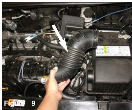
Figure 9 disconnect the air duct from the throttle body and air box and remove the air duct hose