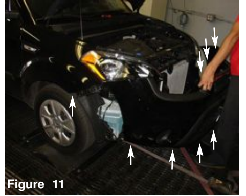
Figure 11 You must remove the front bumper in order to install this intake system. Remove all the screws and plastic retaining clips indicated in the photo and then pull the front bumper off.