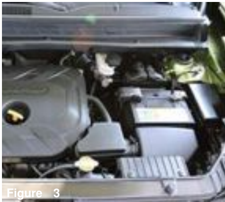
Figure 3 Stock OEM intake system.