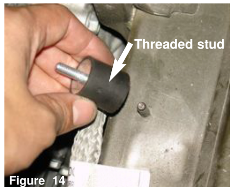
Figure 14 Place the Injen male/female vibramount onto the threaded stud on the chassis where the stock air box assembly once was.