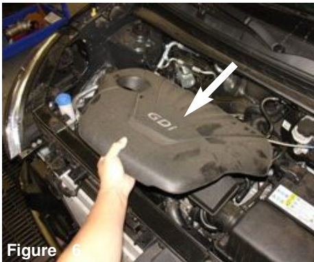
Figure 6 Firmly lift up on the engine cover and remove the engine cover from the engine bay for now. This cover will be re-installed later