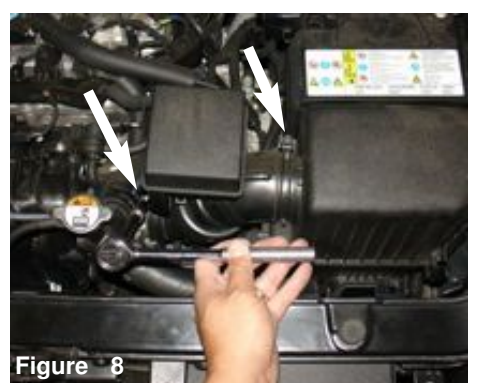
Figure 8 Use a 10mm socket and ratchet and loosen the clamp on the throttle body side and air box side of the air duct hose.