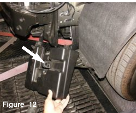
Figure 12 Locate the air box resonator in the drivers side front bumper wheel well area. Remove the 10mm bolt attaching the resonator to the chassis and then pull the entire air box resonator out.