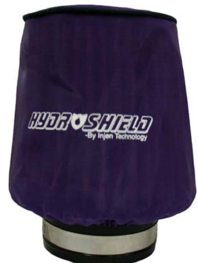
Hydro Shield Sold Separately

Now available, Hydro Shield by Injen Part Number X-1035