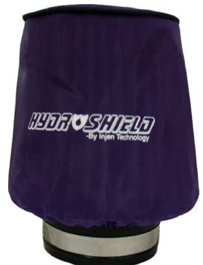
Hydro Shield Sold Separately

Now available, Hydro Shield by Injen Part Number X-1033