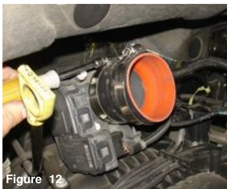
Figure 12 Install the step hose to the throttle body using clamps provided and tighten only on the throttle body only.