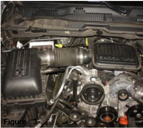
Figure 3 Stock engine compartment