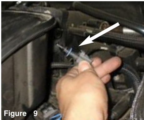
Figure 9 Reach to the back of the resonator box and locate the temp sensor, turn and pull out the temp sensor.