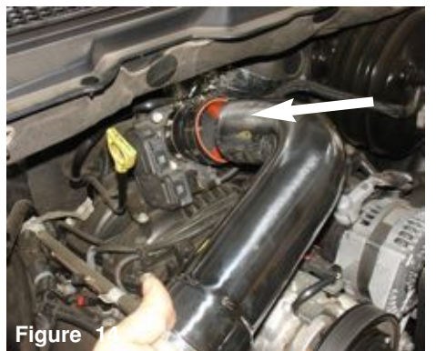
Figure 14 Now install the upper intake assembly to the 3" side of the step hose and tighten using 8mm nut driver.