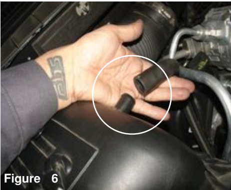
Figure 6 Pull back the crank case line from the air box.