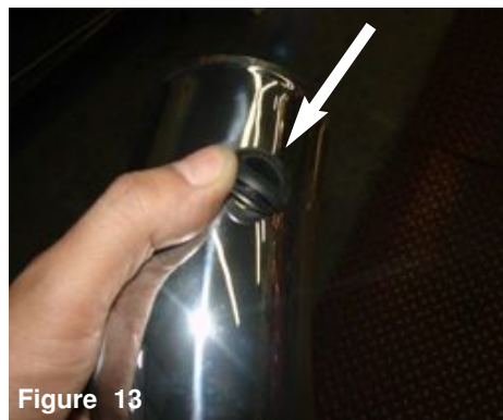
Figure 13 Install the grommet to the hole on the upper intake pipe and secure.