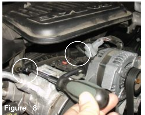
Figure 8 With 8mm nut driver, loosen the 2 fittings holding in the resonator box.