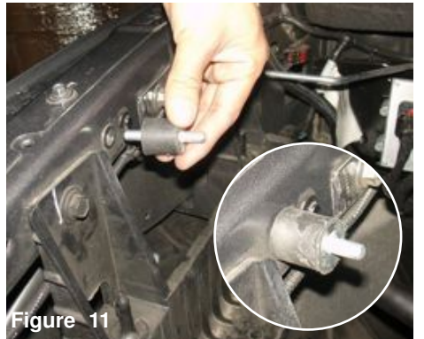
Figure 11 With provided M8 vibra mount install to the threaded fitting located on the fender frame next to air box bracket.