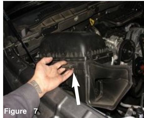
Figure 7 Now carefully lift up the air box assembly and remove from the engine compartment.