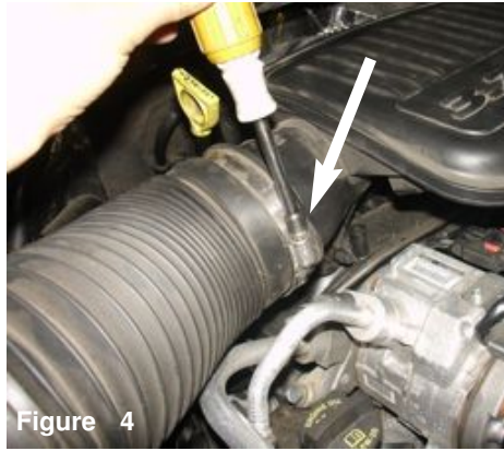
Figure 4 Loosen the clamp on the resonator box using 8mm nut driver.