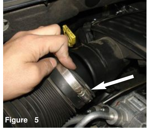
Figure 5 Pull back the intake tube.