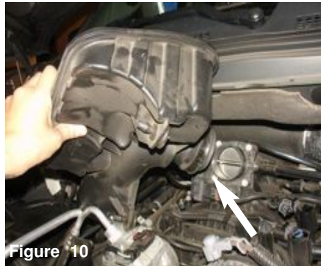
Figure 10 Now pull back and remove the resonator box from the engine compartment.