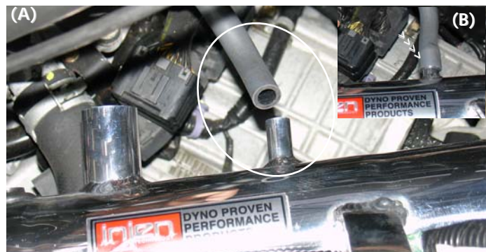
Insert the stock 8mm hose over the 3/8" intake port (A). Press the breather line just enough to hold itself in place (B).