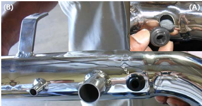
Take the 1525 sensor grommet at place it into the 3/4" pre-drilled hole (A). The sensor grommet groove will fit snug around the 3/4" holes edge (B).