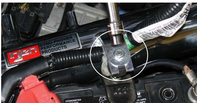
Place the m6 flange nut and fender washer over the intake bracket and vibra-mount stud. Take the m8 socket and Ratchet and semi-tighten the flange nut for now.