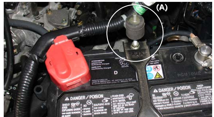
Screw the female vibra-mount over the battery post (A). Usually, 8 complete turns will be enough to level the intake bracket.