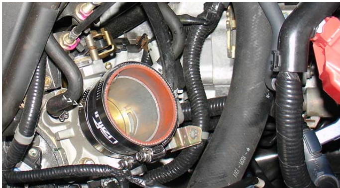
Press the 2 3/4" straight hose over the throttle body, place two clamps over the hose and tighten the hose on the throttle body side.