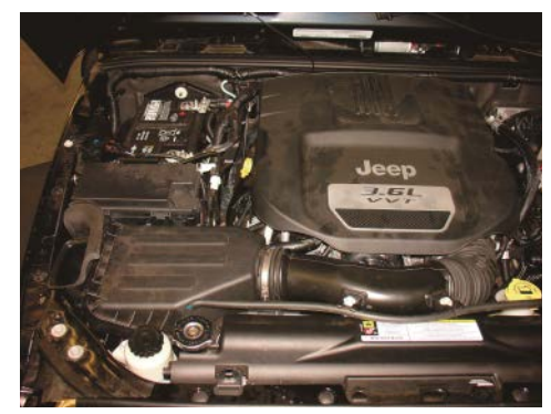
1. Stock intake system.