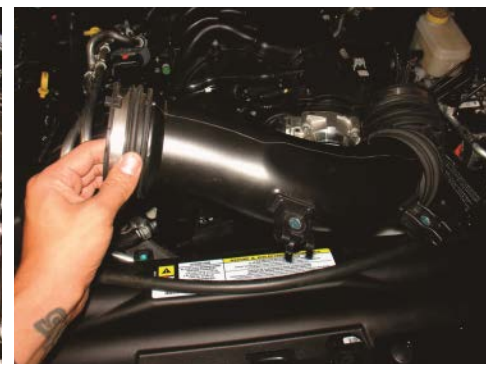
3. Disconnect the IAT harnes and remove the intake tube from the throttle body and air box.