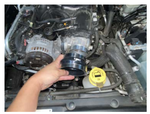
body and secure using the provided clamps.