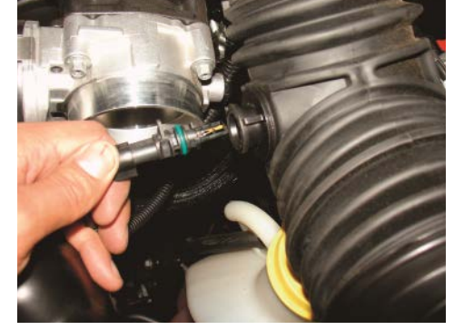
4. Twist the IAT sensor to remove the sensor from the intake tube.