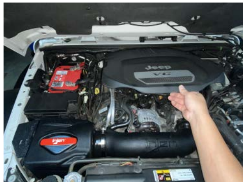
17. Reinstall the engine cover.