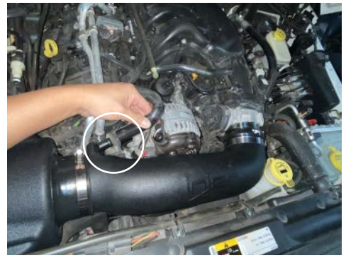
16. Reconnect the crank case breather hose to the injen tube.