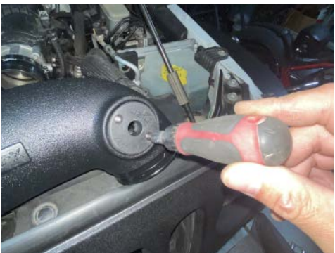
10. Place the hump hose onto the throttle 11. Place the temp sensor adapter onto the tube and secure using the provided M4 bolts.