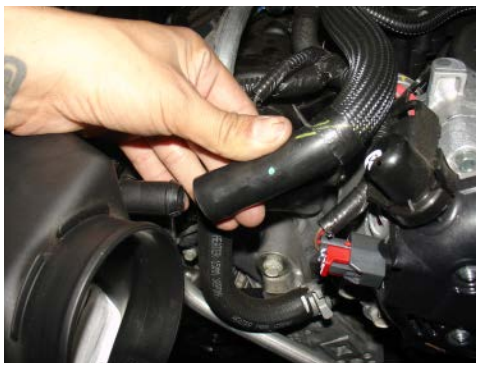
5. Disconnect the crank case breather tube from the stock air box.