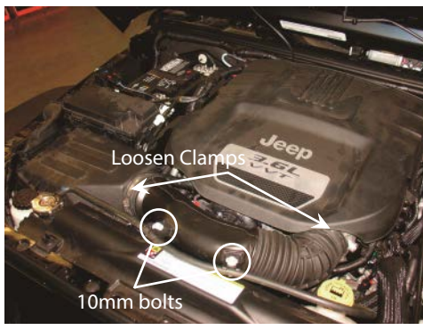
2. Remove the engine cover. Next loosen the two clamps from the intake tube. Finally, reomve the two 10mm bolts.