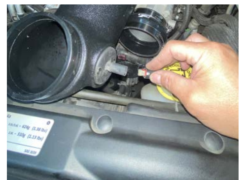
13. Connect the IAT harness.