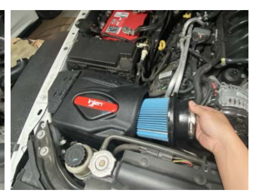
9. Install the twist lock filter on to the Injen air box. Once seated, rotate the filter a 1/4 turn in either direction so the filter can lock into place