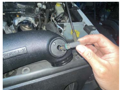
12. Install the IAT sensor to the adapter. Once fully seated, rotate the sensor to secure in place.