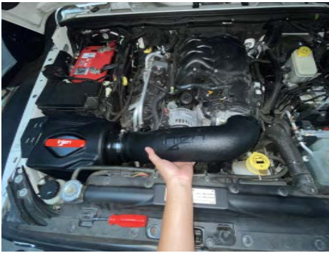
14. Insert the Injen intake tube into the vehicle. Position tube to the filter and hump hose.