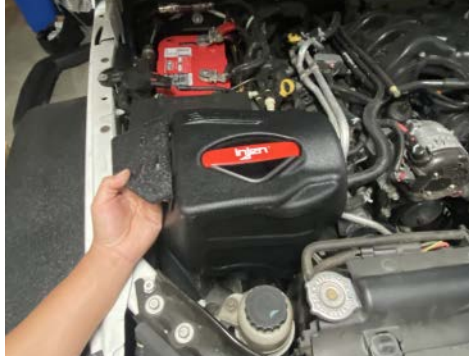
8. Install the Injen air box into the engine bay. Line up to the stock grommets and push down on the air box to secure.