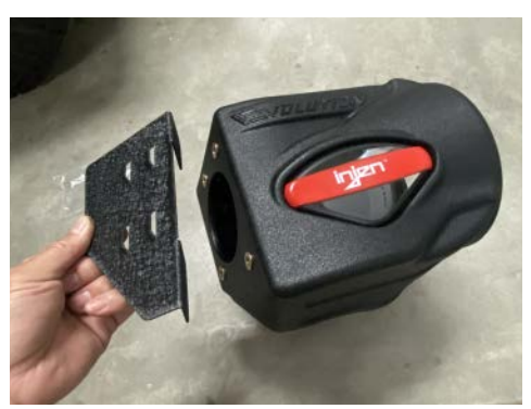
7. Bolt down the heatshield to the air box using the provided M6 bolts.