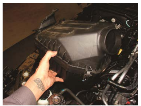
6. Remove the stock air box by firmly lifting it out of the engine bay.