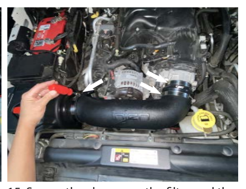
15. Secure the clamps on the filter and the hump hose.