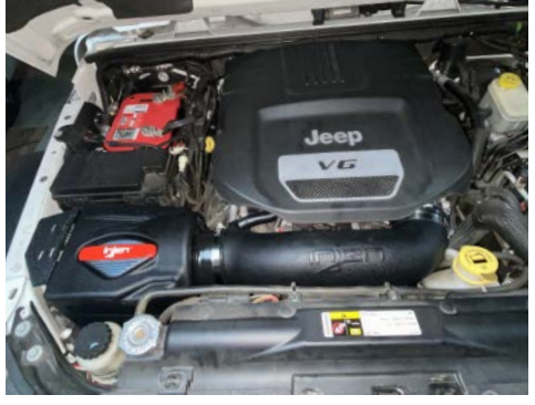
18. Ensure all bolts, hoses, and clamps are properly secured.