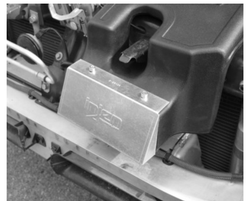
Rain guard installation is now complete. Re-install and secure the intake system. Note: Check clearance and adjust if needed! Failure to check the alignment and adjust the intake can cause damage that will void the warranty. Injen Technology is not responsible for any damages caused by/from improper installation.