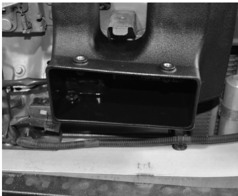
Remove front bumper cover. (see Injen Evolution instruction sheet EVO1800)

WARNING: FAILURE TO FOLLOW INSTALLATION INSTRUCTIONS AND NOT USING THE PROVIDED HARDWARE MAY DAMAGE THE INTAKE SYSTEM, ENGINE AND COMPONENTS!!! *Do not attempt to install the intake system while the engine is hot. Severe burn could result from touching hot engine components!