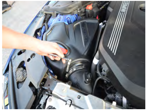
20. Secure the clamp on the twist lock filter.