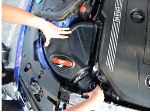
19. Press the Injen tube into the twist lock filter.