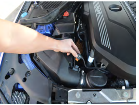
2. Disconnect the temp sensor harness.