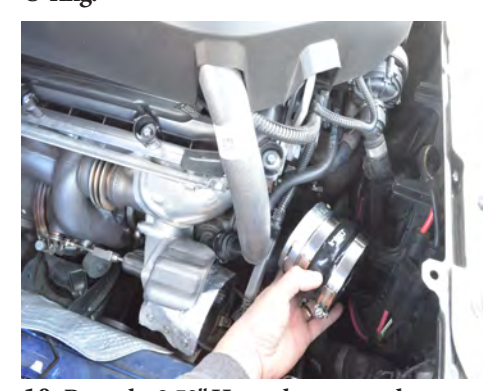
10. Press the 3.50" Hump hose on to the billet machine adapter then secure it using the provide clamps.