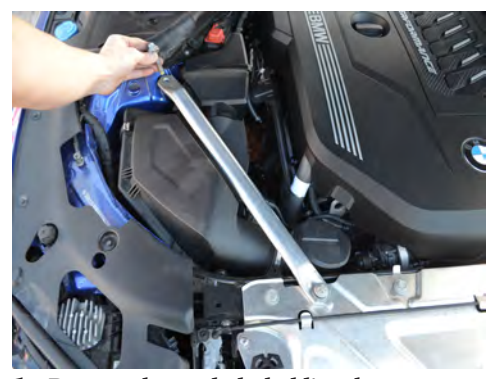
1. Remove the two bolts holding the strut tower brace. Then remove the strut tower brace.