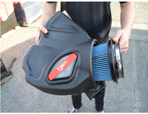
box. Once seated, rotate the filter a 1/4 turn in either direction so the filter can lock into place.