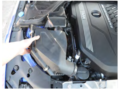
4. Remove the OEM air box.