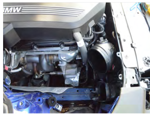
15. Secure both clamps on the 3.50" hump