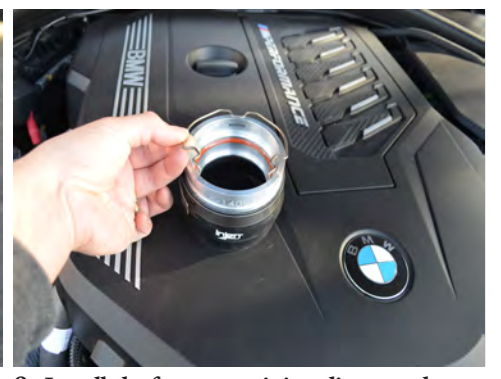
9. Install the factory retaining clip on to the billet machined adapter. The center of the retaining clip must face the part number.