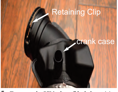
5. To remove the OEM tube, pull back the retaining clip on the tube with a prying tool. Next, slide out the tube from the turbo. Finally, press on the tabs located on the crank case line and detach it from the tube.