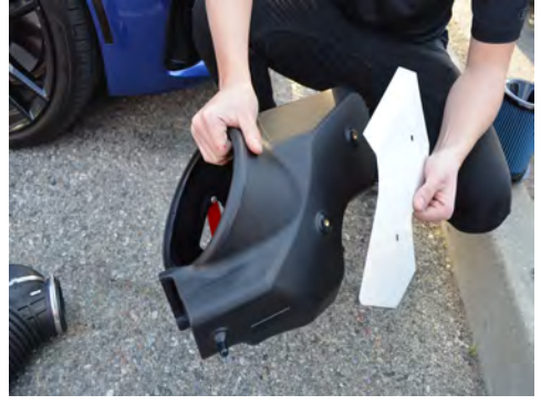
16. Bolt down the provided heat shield to the Injen air box.