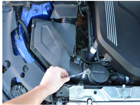
3. Loosen the clamp holding the OEM air box and tube together.