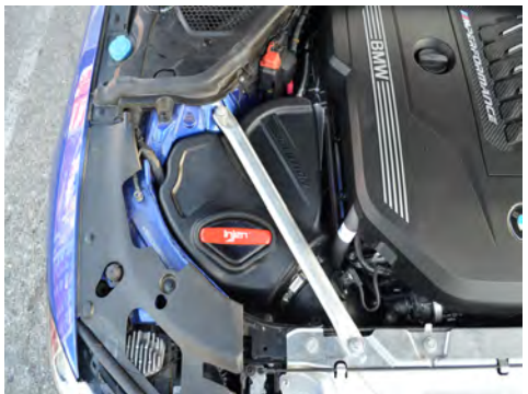
23. Ensure all bolts and clamps are secured properly.

Congratulations! You have just completed the installation of this intake system. Periodically, check the alignment of the intake, normal wear and tear can cause nuts and bolts to come loose. Note: Check clearance and adjust if needed! Failure to check the alignment and adjust the intake can cause damage that will void the warranty. Injen Technology is not responsible for any damages caused by/ from improper installation.