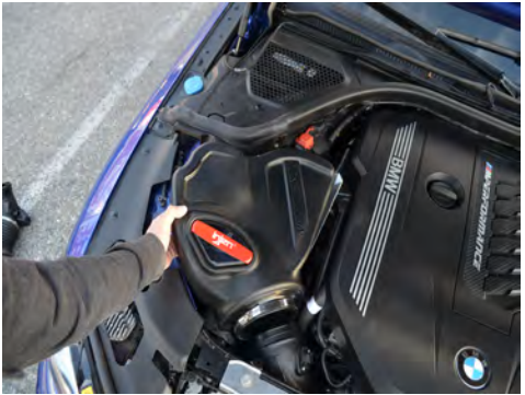
17. Install the twist lock filter on to the Injen air 16. Install the Injen air box into the engine bay. Line up the studs on the air box to the factory grommets and press down on the box.