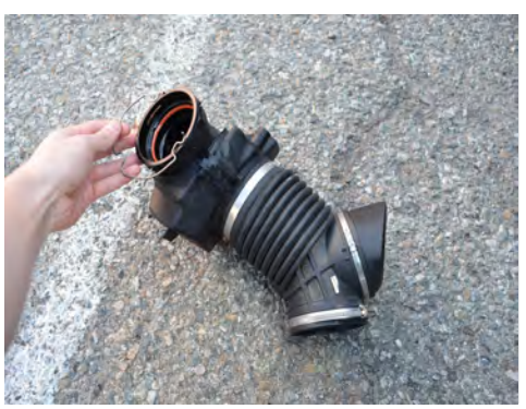
6. Remove the OEM retaining clip from the tube. It will be reused on the Injen intake.