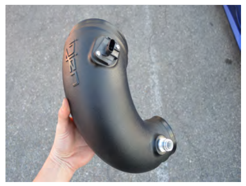
13. Install the temp sensor onto the Injen tube and secure using the provided M4 button head