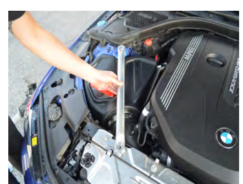
22. Reinstall the strut tower brace.