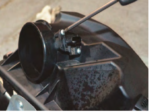
12. Remove the two screws holding the temp senor then remove the temp sensor.