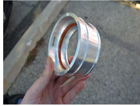
8. Install the O-ring onto the billet machined adapter. Make sure to install it in the same direction as the OEM tube.