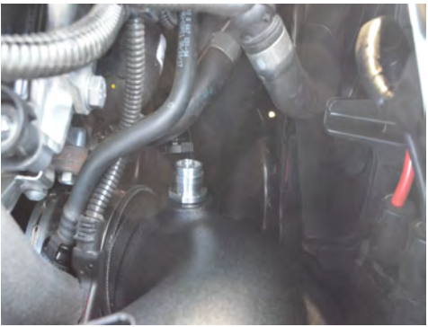
14. Install the Injen tube and attach the crank case line to the machined fitting.