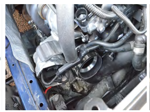
11. Press the billet machined adapter on to the turbo inlet until you hear the retaining clip snap into place.