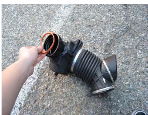
7. Take note of which direction the O-ring is installed in the OEM tube then remove the O-ring.