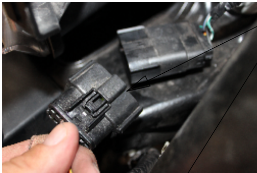
Step 5 unplug both wiring harnesses