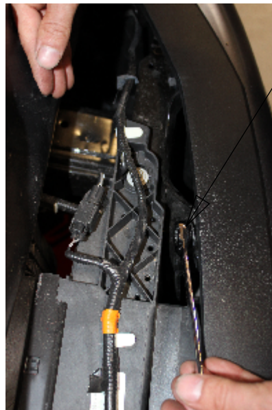
Step 5 Upper bumper retaining bolts