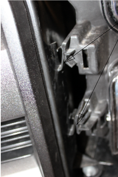
Step 4 Grille retaining tabs two per side