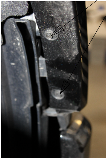
Step 4 Fender flare retaining bolts