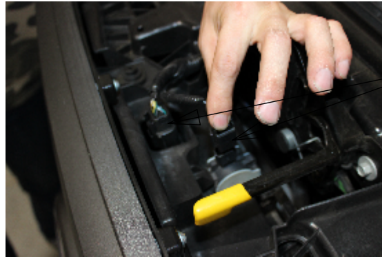
Step 3 Unplug grille shutter harnesses