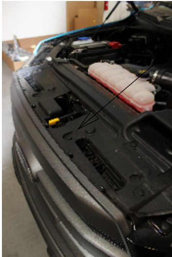
Step 2 remove radiator cover panel