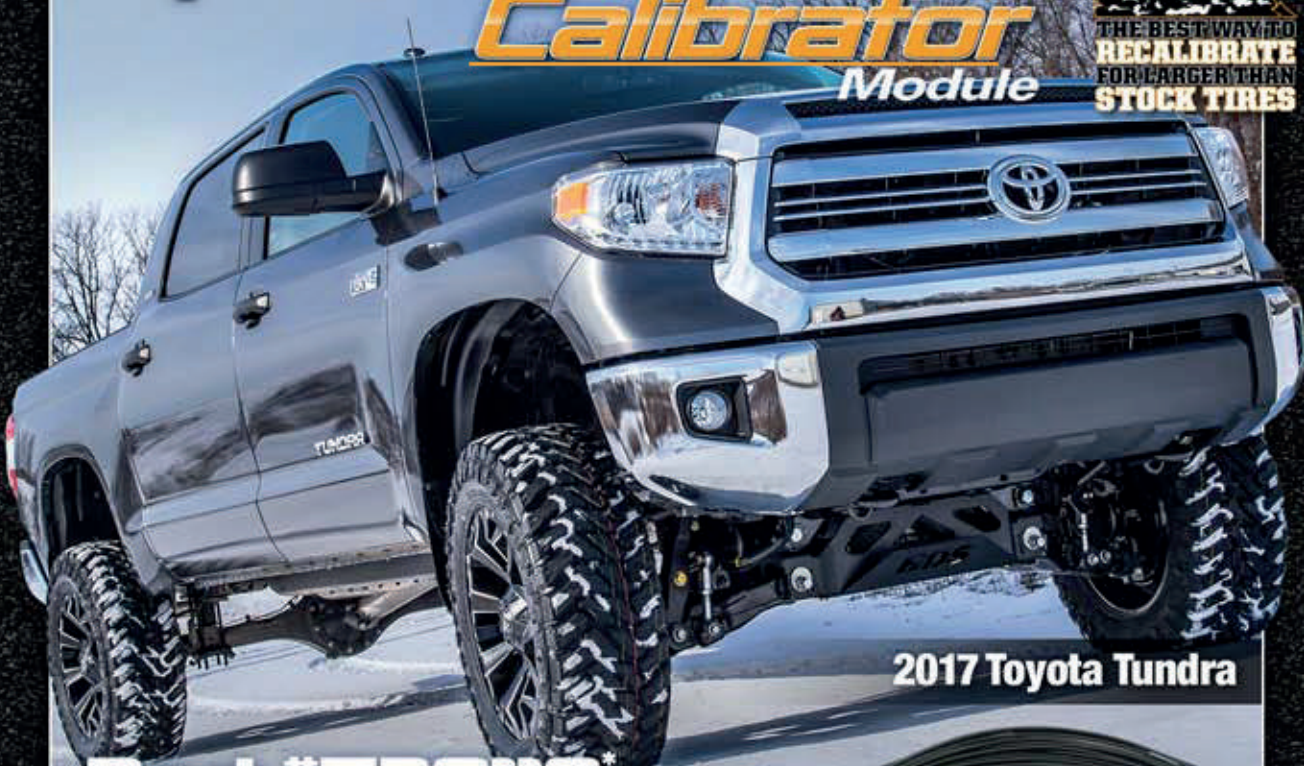
2017 Toyota Tundra