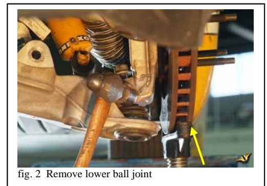
fig. 2 Remove lower ball joint