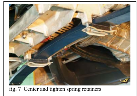
fig. 7 Center and tighten spring retainers