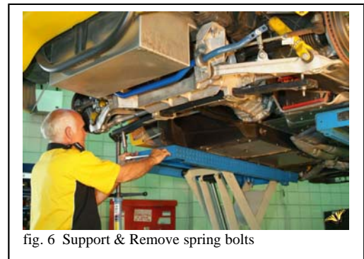
fig. 6 Support & Remove spring bolts

You are now ready to install your new rear spring.