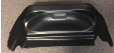
Wheel Well Guard Driver's Side (1)