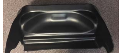
Wheel Well Guard Passenger's Side (1)