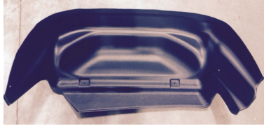
Wheel Well Guard Driver's Side (1)