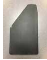
Universal Mud Flap Passenger's Side (1)