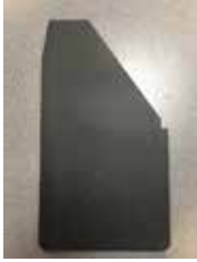
Universal Mud Flap Driver's Side (1)