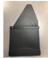
Kick Back Mud Flap Passenger's Side (1)