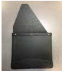
Kick Back Mud Flap Driver's Side (1)