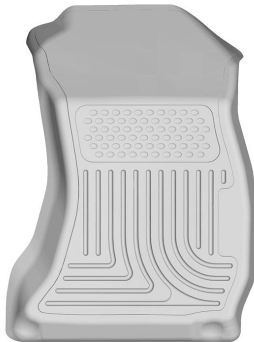
RIGHT OR PASSENGER'S SIDE

TO EASE INSTALLATION OF YOUR FRONT FLOOR LINERS, FIRST SLIDE BOTH FRONT ROW SEATS ALL THE WAY BACK TO ALLOW THE MOST LEG ROOM. NOTE: INSTALL THE DRIVER'S SIDE LINER MAKING SURE TO SECURE IT WITH THE FACTORY CARPET MAT RETAINING POSTS (POSTS FIT THROUGH HOLES IN LINER). ONCE LINERS ARE INSTALLED, REPOSITION THE SEATS AS DESIRED.