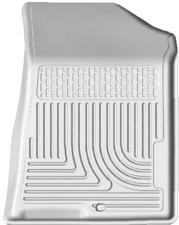
RIGHT OR PASSENEGER'S SIDE

TO EASE INSTALLATION OF YOUR SONATA FRONT FLOOR LINERS, FIRST SLIDE BOTH FRONT ROW SEATS ALL THE WAY BACK TO EXPOSE THE FRONT FLOOR PANS. ONCE YOU HAVE INSTALLED THE FRONT LINERS, REPOSITION THE FRONT SEATS AS DESIRED. NOTE THAT DRIVER'S SIDE LINER ATTACHES TO THE FACTORY MAT RETAINING HOOKS LOCATED IN THE DRIVER'S SIDE FLOOR PAN.