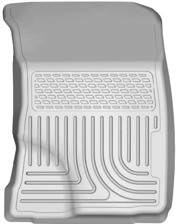
RIGHT OR PASSENEGER'S SIDE

TO EASE INSTALLATION OF YOUR CIVIC FRONT FLOOR LINERS, FIRST SLIDE BOTH FRONT ROW SEATS ALL THE WAY BACK TO EXPOSE THE FRONT FLOOR PANS. ONCE YOU HAVE INSTALLED THE FRONT LINERS, REPOSITION THE FRONT SEATS AS DESIRED. NOTE THAT DRIVER'S SIDE LINER ATTACHES TO THE FACTORY "TWIST-LOCK" FASTENERS LOCATED IN THE DRIVER'S SIDE FLOOR PAN.