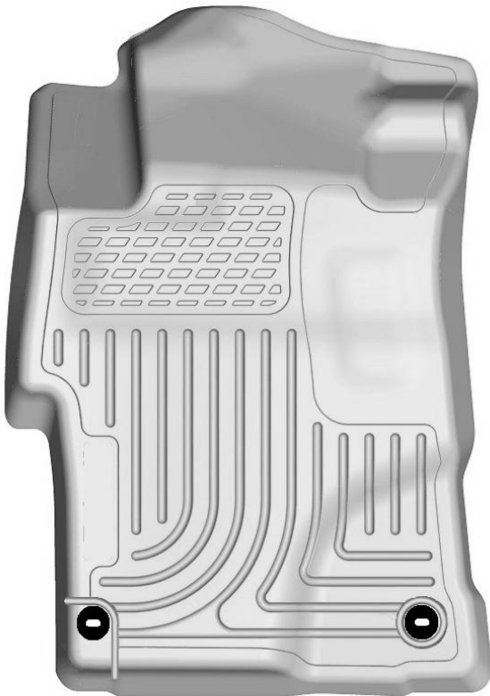
LEFT OR DRIVER'S SIDE