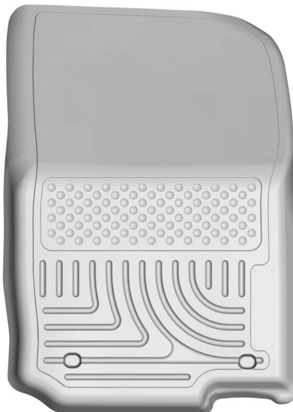
RIGHT OR PASSENGER'S SIDE

TO EASE INSTALLATION OF YOUR MERCEDES ML350 FRONT FLOOR LINERS, SLIDE BOTH FRONT ROW SEATS ALL THE WAY REARWARD SO AS TO ALLOW THE MOST LEG ROOM. ONCE YOU HAVE INSTALLED YOUR LINERS, REPOSITION THE FRONT SEATS AS DESIRED. NOTE THAT THE DRIVER'S SIDE LINER ATTACHES TO THE FACTORY MAT RETAINING POSTS. PLEASE MAKE CERTAIN THAT THE LINER IS SECURELY POSITIONED ON THE RETAINING POSTS BEFORE OPERATING VEHICLE.