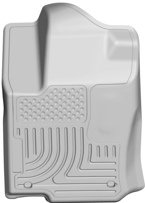
LEFT OR DRIVER'S SIDE