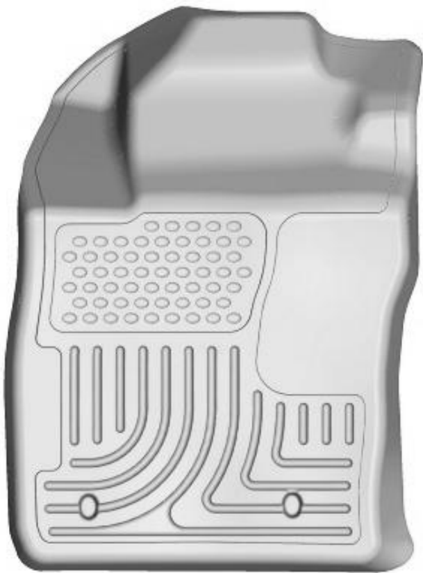
LEFT OR DRIVER'S