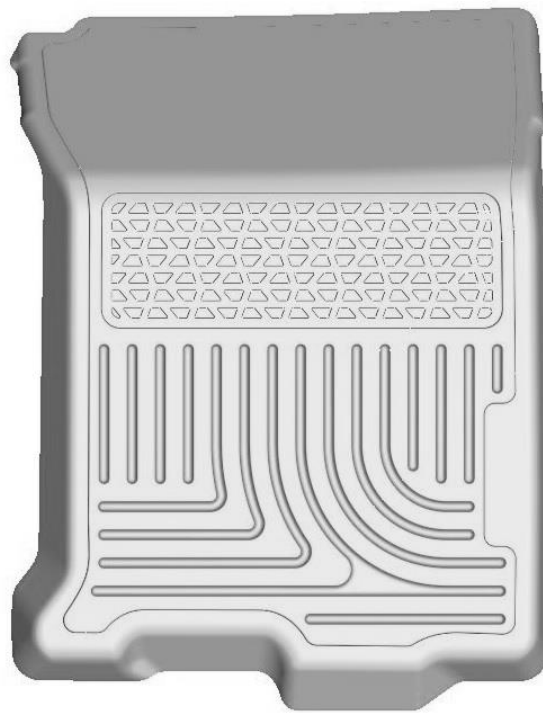
RIGHT OR PASSENGER'S SIDE