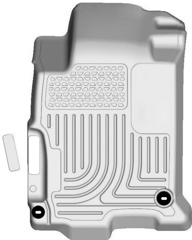
LEFT OR DRIVER'S SIDE