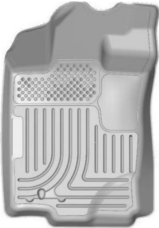
LEFT OR DRIVER'S