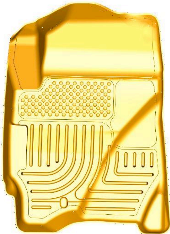
LEFT OR DRIVER'S