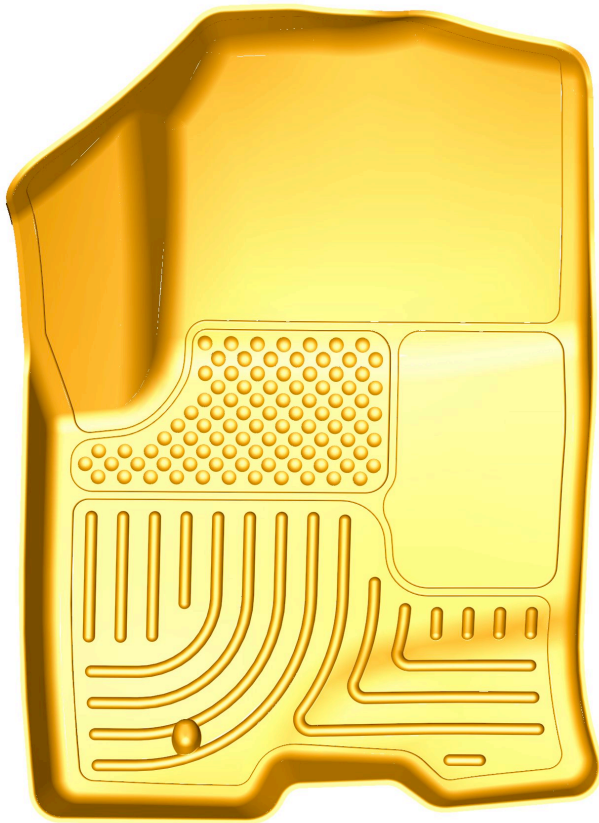
LEFT OR DRIVER'S