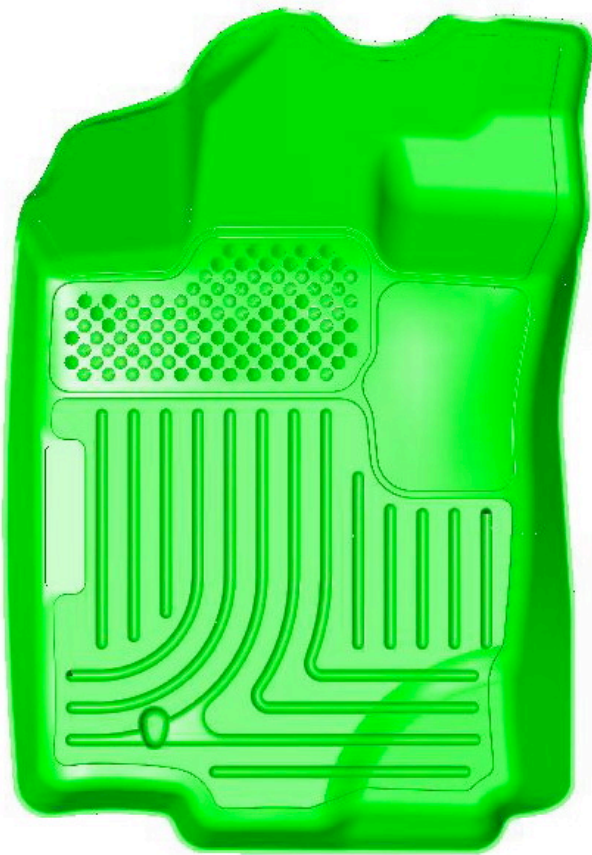
LEFT OR DRIVER'S