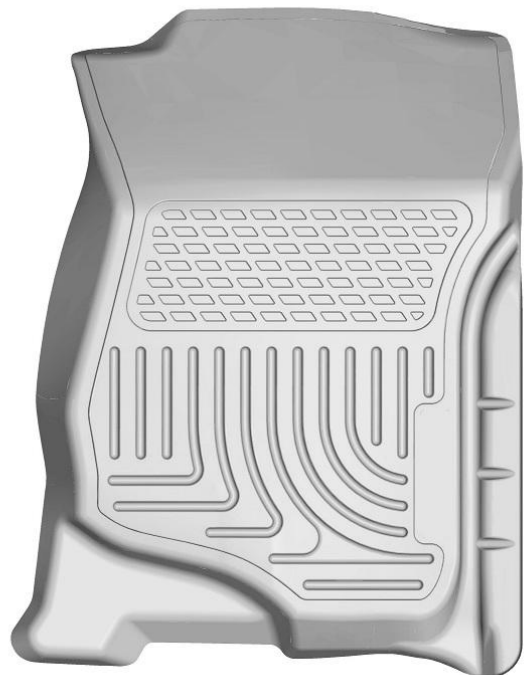
RIGHT OR PASSENGER'S SIDE

EASE INSTALLATION OF YOUR FRONT FLOOR LINERS, FIRST MOVE THE FRONT ROW SEATS TO THEIR MOST REARWARD POSITION. WITH THIS DONE, INSTALL THE LINERS ORIENTED AS SHOWN ABOVE AND THEN REPOSITION SEATS AS DESIRED.