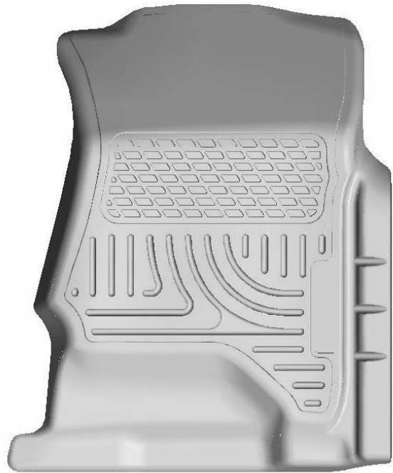
RIGHT OR PASSENGER'S SIDE

TO EASE INSTALLATION OF YOUR NEW FRONT LINERS, MOVE BOTH FRONT ROW SEATS TO THEIR MOST REARWARD POSITION. WITH THIS DONE, INSTALL THE LINERS AS SHOWN ABOVE. THE DRIVERS SIDE LINER HAS TWO HOLES WHICH SNAP OVER THE FACTORY MAT RETAINERS. ONCE YOU HAVE INSTALLED YOUR LINERS, REPOSITION THE SEATS AS DESIRED.