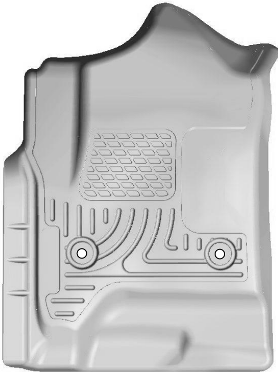
LEFT OR DRIVER'S SIDE