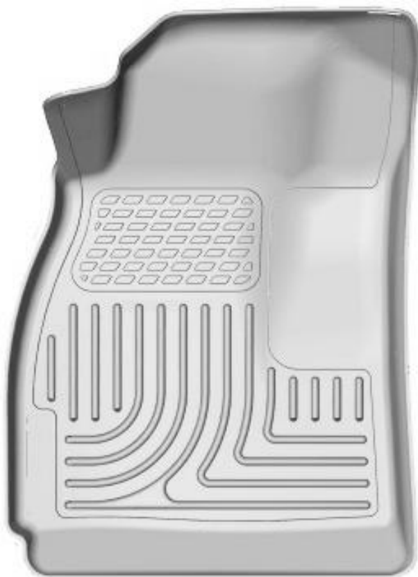
LEFT OR DRIVER' SIDE