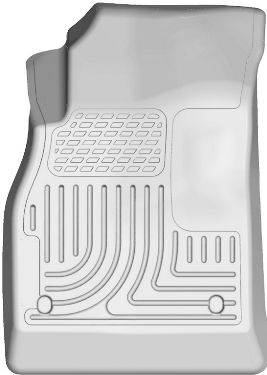
LEFT OR DRIVER'S SIDE