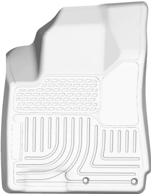
LEFT OR DRIVER' SIDE