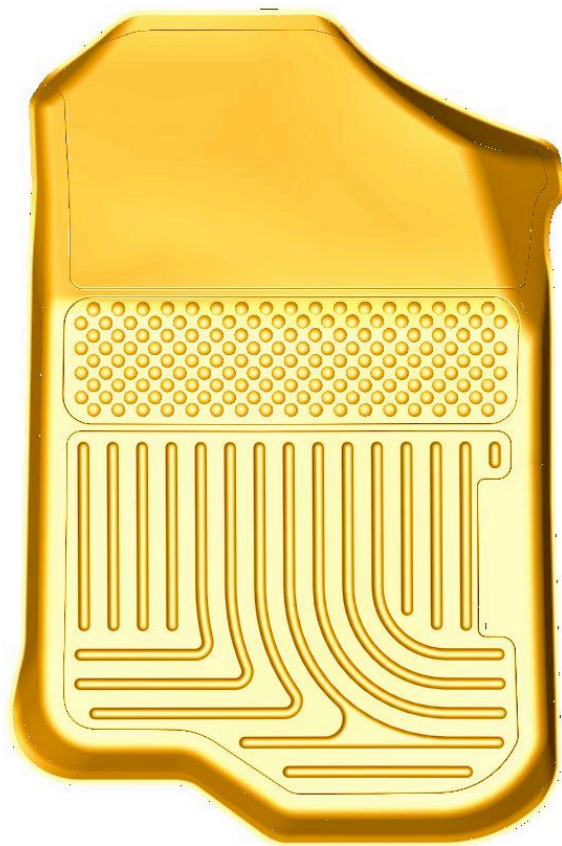
RIGHT OR PASSENGER'S SIDE

TO EASE INSTALLATION OF YOUR MALIBU/AURA FRONT LINERS, MOVE BOTH FRONT SEATS TO THEIR MOST REARWARD POSITION. ONCE YOU HAVE INSTALLED YOUR LINERS, REPOSITION THE SEATS AS DESIRED.