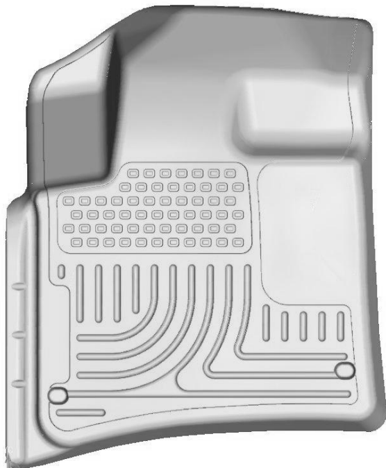
LEFT OR DRIVER'S SIDE