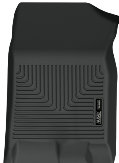
RIGHT OR PASSENGER'S

TO EASE INSTALLATION OF YOUR NEW FRONT LINERS, MOVE BOTH FRONT ROW SEATS TO THEIR MOST REARWARD POSITION. WITH THIS DONE, INSTALL THE LINERS AS SHOWN ABOVE. THE DRIVER SIDE LINER WILL ATTACH TO THE FACTORY FLOOR MAT RETAINING POSTS. ONCE YOU HAVE INSTALLED YOUR LINERS, REPOSITION THE SEATS AS DESIRED.