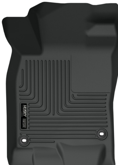
LEFT OR DRIVER'S