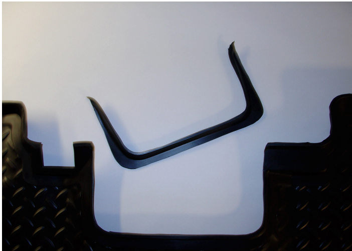
6317 SHOWN TRIMMED FOR USE WITH LONG CONSOLE (UP TO 04')