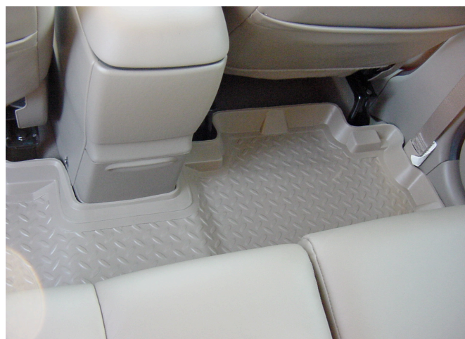
6317 SHOWN IN VEHICLE WITH THE LONG CONSOLE (UP TO 04')