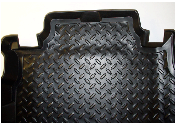
6317 SHOWN TRIMMED FOR USE WITH POWER SEAT EQUIPPED MODELS