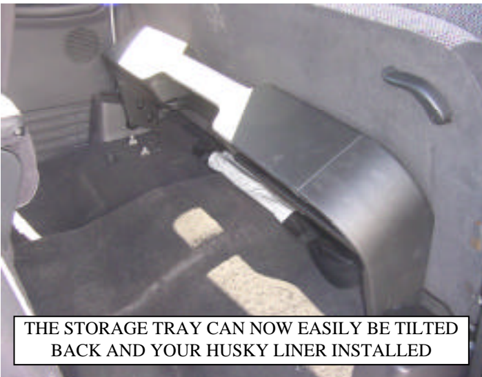
THE STORAGE TRAY CAN NOW EASILY BE TILTED BACK AND YOUR HUSKY LINER INSTALLED