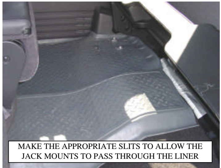
MAKE THE APPROPRIATE SLITS TO ALLOW THE JACK MOUNTS TO PASS THROUGH THE LINER