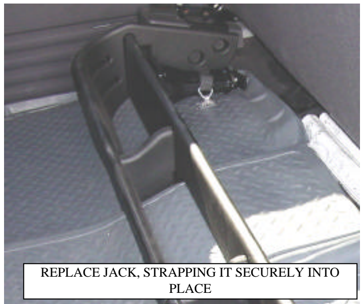
REPLACE JACK, STRAPPING IT SECURELY INTO PLACE