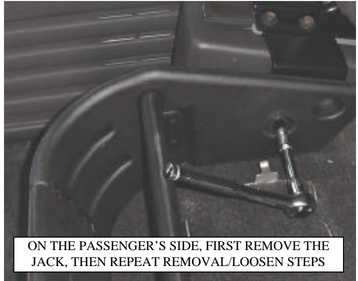
ON THE PASSENGER'S SIDE, FIRST REMOVE THE JACK, THEN REPEAT REMOVAL/LOOSEN STEPS