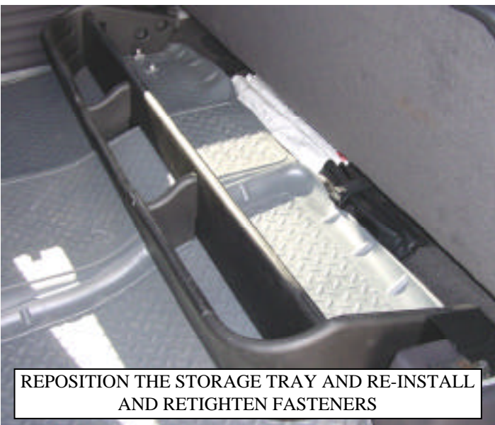
REPOSITION THE STORAGE TRAY AND RE-INSTALL AND RETIGHTEN FASTENERS