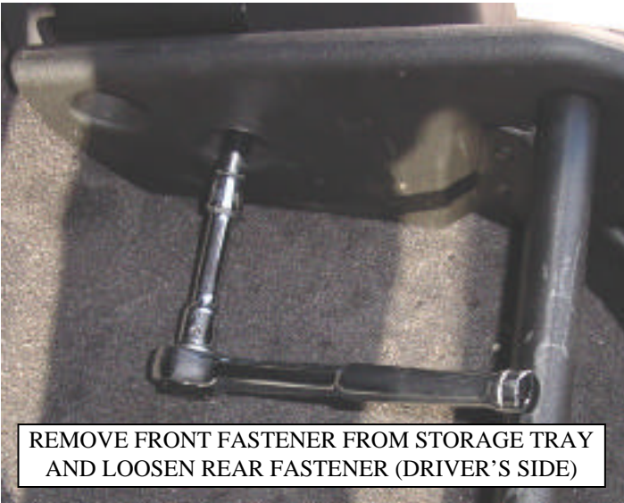
REMOVE FRONT FASTENER FROM STORAGE TRAY AND LOOSEN REAR FASTENER (DRIVER'S SIDE)