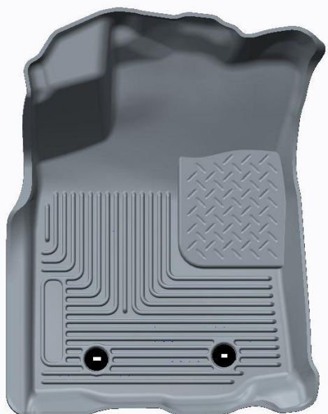
LEFT OR DRIVER

Your liners are made from an engineering resin that is lightweight and extremely tough and durable. The easiest way to clean your liners is with a damp cloth or sponge and soap and water. Windex®, 409® and Armor All® type cleaners work as well.