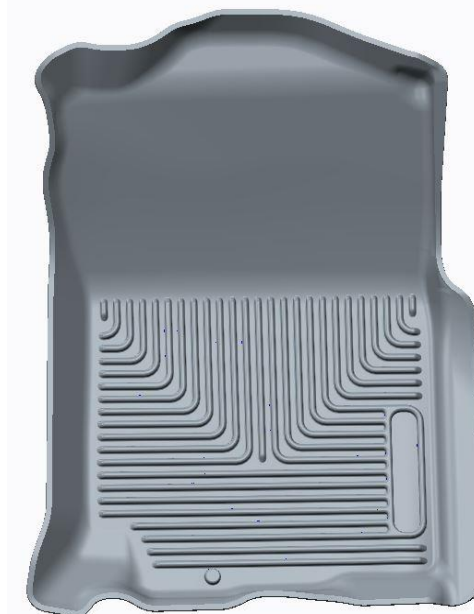
RIGHT OR PASSENGER